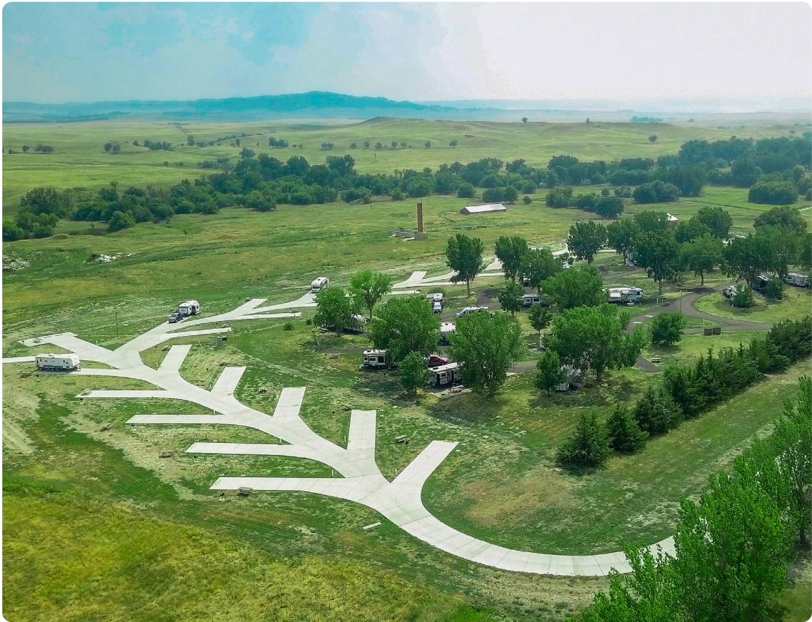
The expansion of Fort Robinson State Park's Red Cloud Campground started in fiscal year 2020-21 and continues in 2021-22.