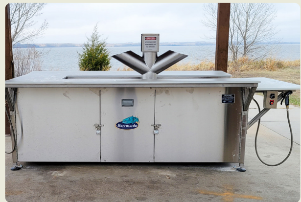
Calamus State Recreation Area renovated two fish-cleaning stations with grinders as part of the completed projects of fiscal year 2020-21. Upgraded fish-cleaning stations also were installed at four other state park areas.