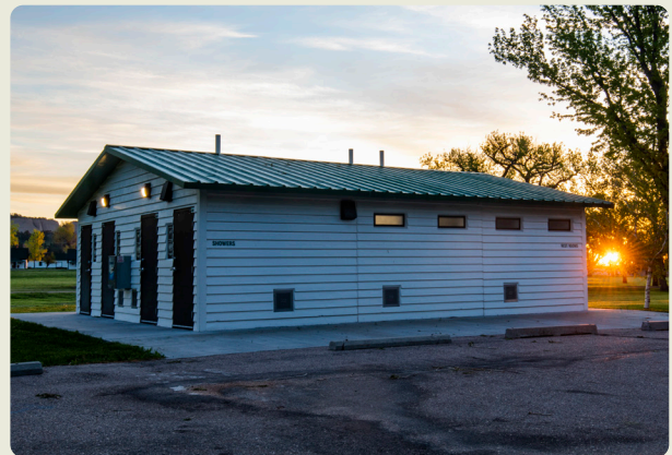
As part of the Soldier Creek Campground expansion at Fort Robinson State Park, a replacement shower house and restroom were built in fiscal year 2020-21.