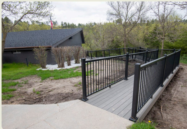
Smith Falls State Park received a refurbished deck and walkway to meet accessibility standards in 2020-21 fiscal year. Work continues in 2021-22.

Windmill vault toilet restroom replacement (2)