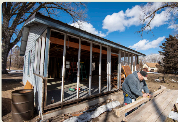
Renovations to the two rustic cabins at Victoria Springs State Recreation Area near Anselmo are being made. This includes making them wheelchair accessible, increasing living space and adding new decks with views of the lake.