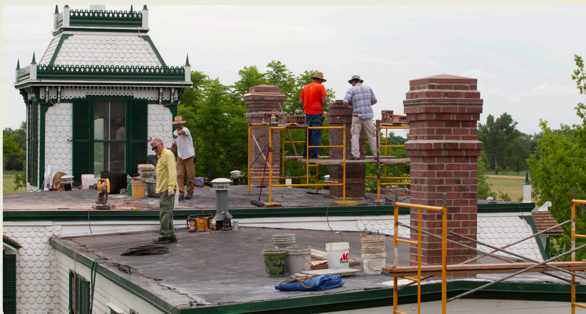
The Buffalo Bill Ranch State Historical Park mansion roof was replaced in fiscal year 2020-21.

Between 2020 and 2023, nearly $24 million in Capital Maintenance Fund dollars is expected to be spent on improvements. Additional dollars from agency and federal funds also will be used for these projects.