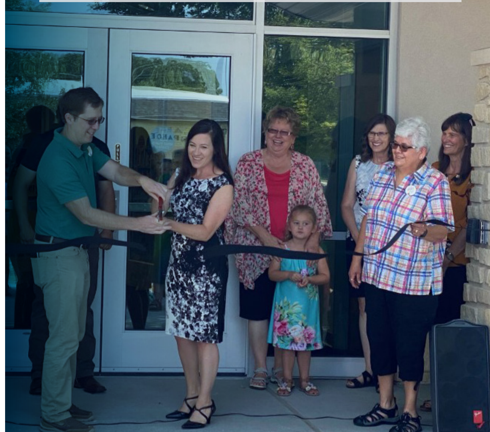
Project leaders cut the ribbon on Arapahoe Public Library.

The project was made possible in part by a grant from the Civic and Community Center Financing Fund's Planning category.