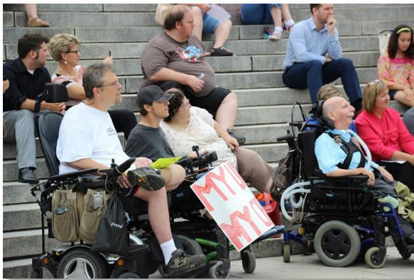
Image 1: Members of the disability community on the steps of the Nebraska Capitol.

In addition to these Core Values, the following Guiding Principles serve as a foundation for Nebraska’s Olmstead Plan: