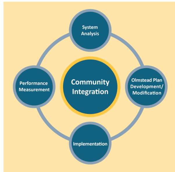
Figure 1. Cycle of Olmstead Planning TAC 2019