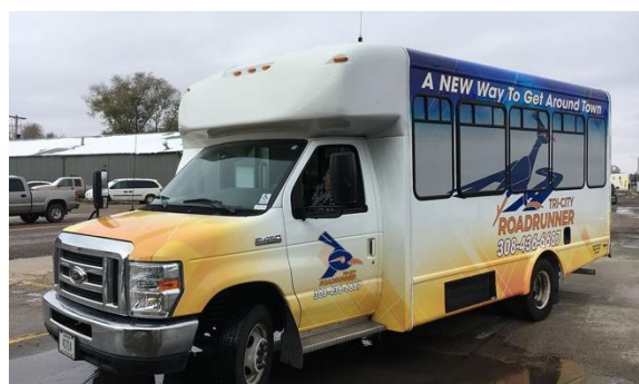
Image 5: The Tri City Roadrunner connects Gering, Terrytown, and Scottsbluff in Western Nebraska.