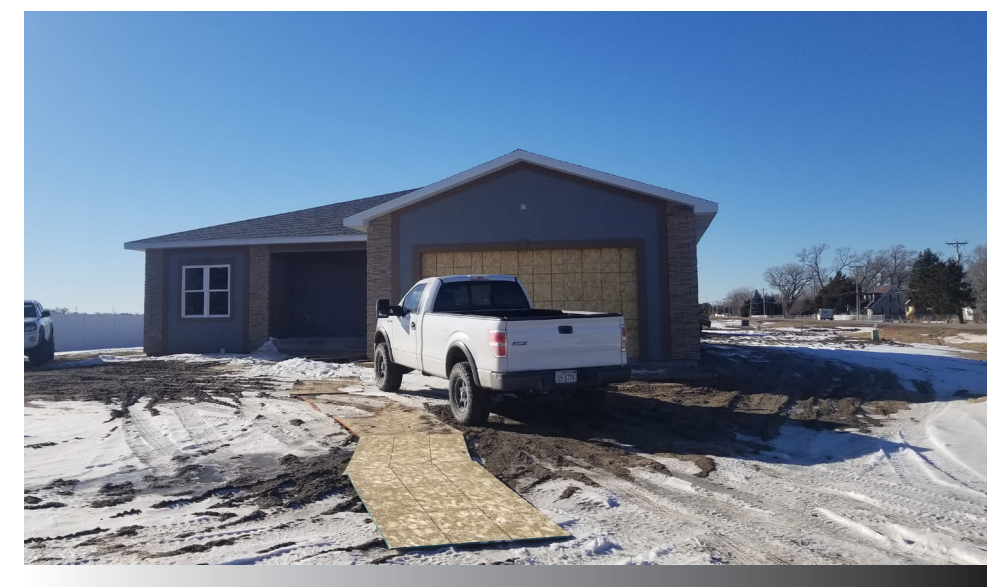
Single-family home built in Brady with support from LB 518.

Table 4.1 provides matching summaries and other information for each of the aforementioned recipients. Note that annual audits are scheduled for a February 15, 2020 completion date.