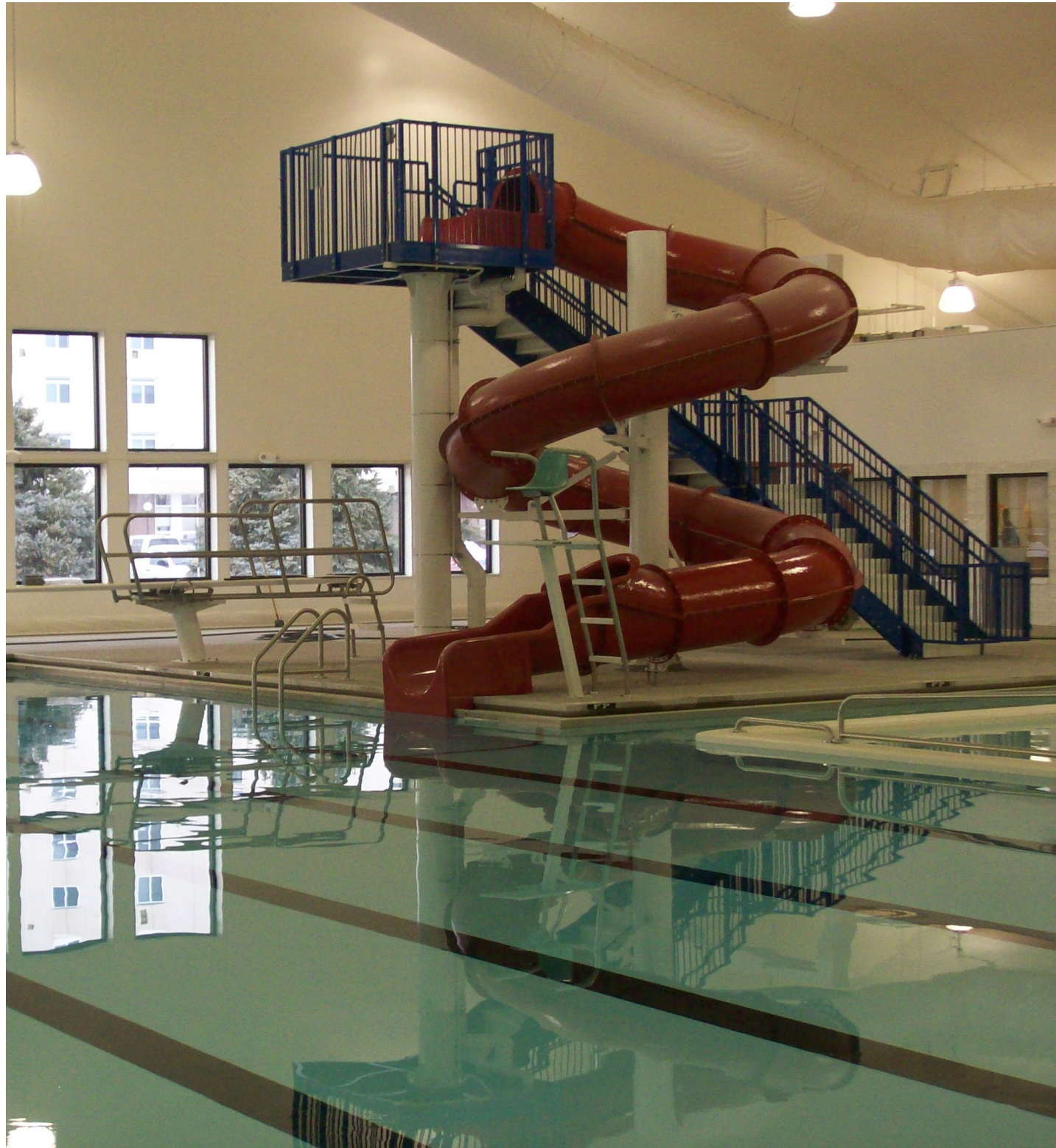
Aquatic Center in Chadron.