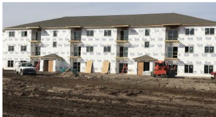
Schuyler's Eastview Apartments contain 24 units, including one-, two- and three-bedroom options.

The resulting projects will enhance Nebraska's ability to attract and retain a skilled workforce.