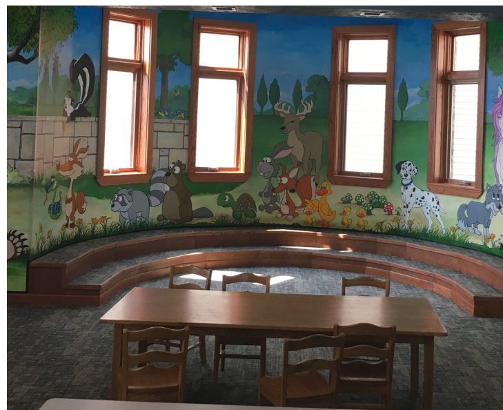
Deshler Public Library children's area.

The Civic and Community Center Financing Fund (CCCFF) enables DED to provide financial resources to support meaningful local projects, leading to more vibrant cities and villages across Nebraska.