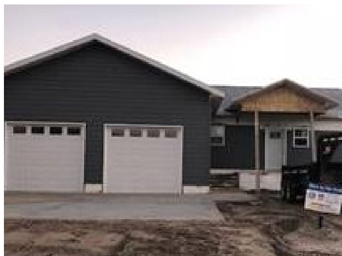
The North Platte Area Chamber and Development Corporation invested in this single-family homebuyer unit with support from the RWHF.

Introduced by Senator Matt Williams, LB 518 channeled approximately $7 million from the Nebraska Affordable Housing Trust Fund into a new fund — the Rural Workforce Housing Fund (RWHF). DED administers the program on behalf of the State of Nebraska. Investment funds must be located in counties of less than 100,000.