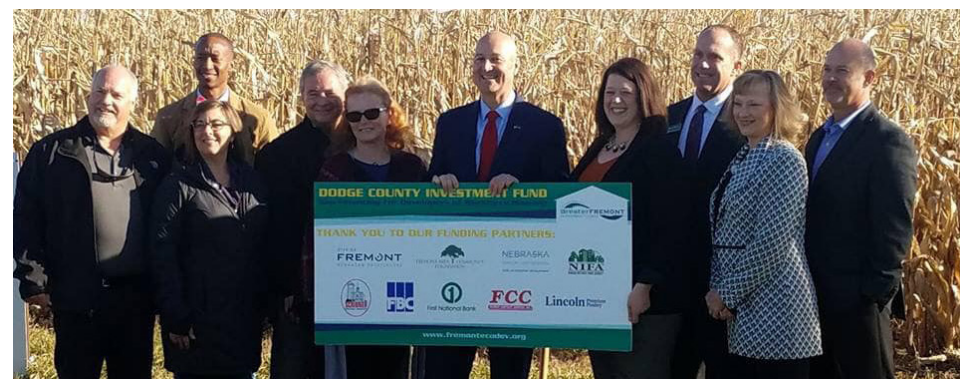
Groundbreaking in Fremont for multifamily rental project.