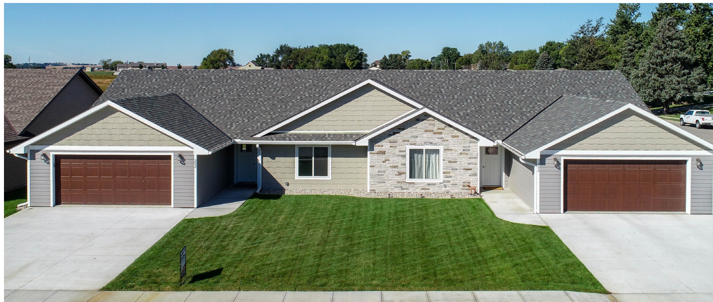
Townhouse design for units to be built in Schuyler.