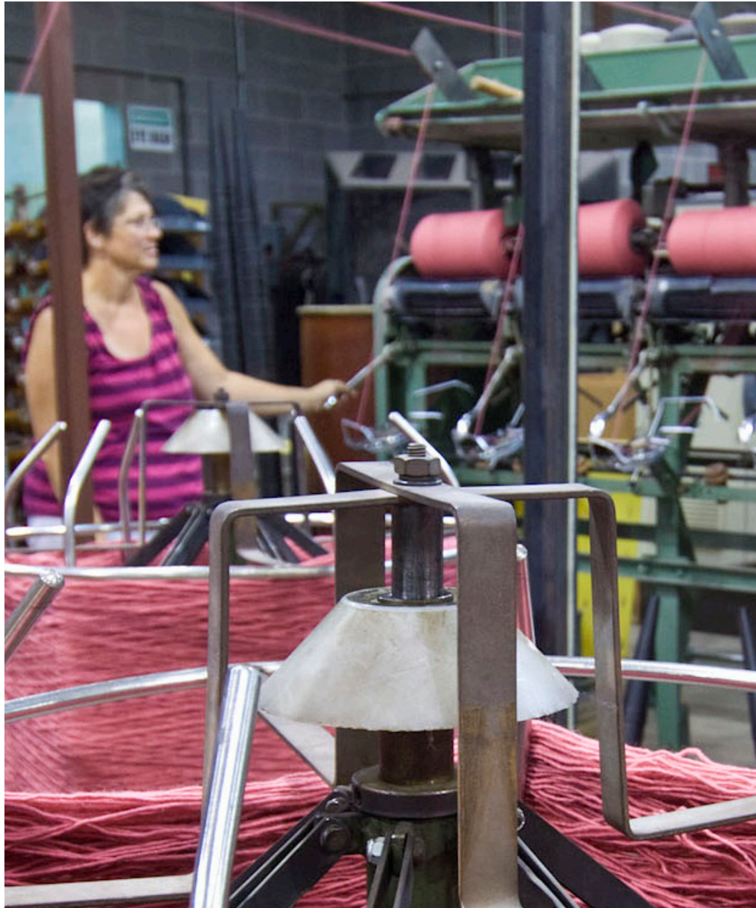
Brown Sheep Yarn, Mitchell.