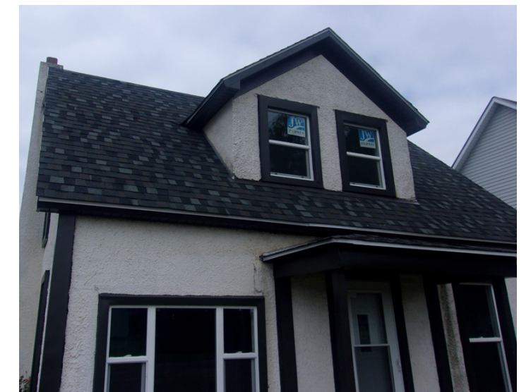
Before and after photos showing NAHTF program assistance.