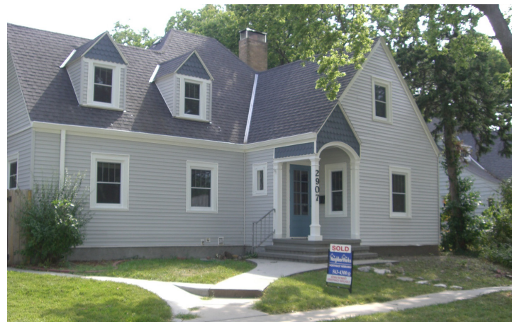
Single-family home in Columbus rehabilitated with support from NAHTF.

Housing is a resource that can enhance communities' ability to attract, retain and accommodate residents, while promoting a high standard of living. Established in 1996, the Nebraska Affordable Housing Trust Fund (NAHTF) provides a financial resource to help Nebraska communities address financial challenges and eliminate obstacles to the development of quality, safe, affordable homes.