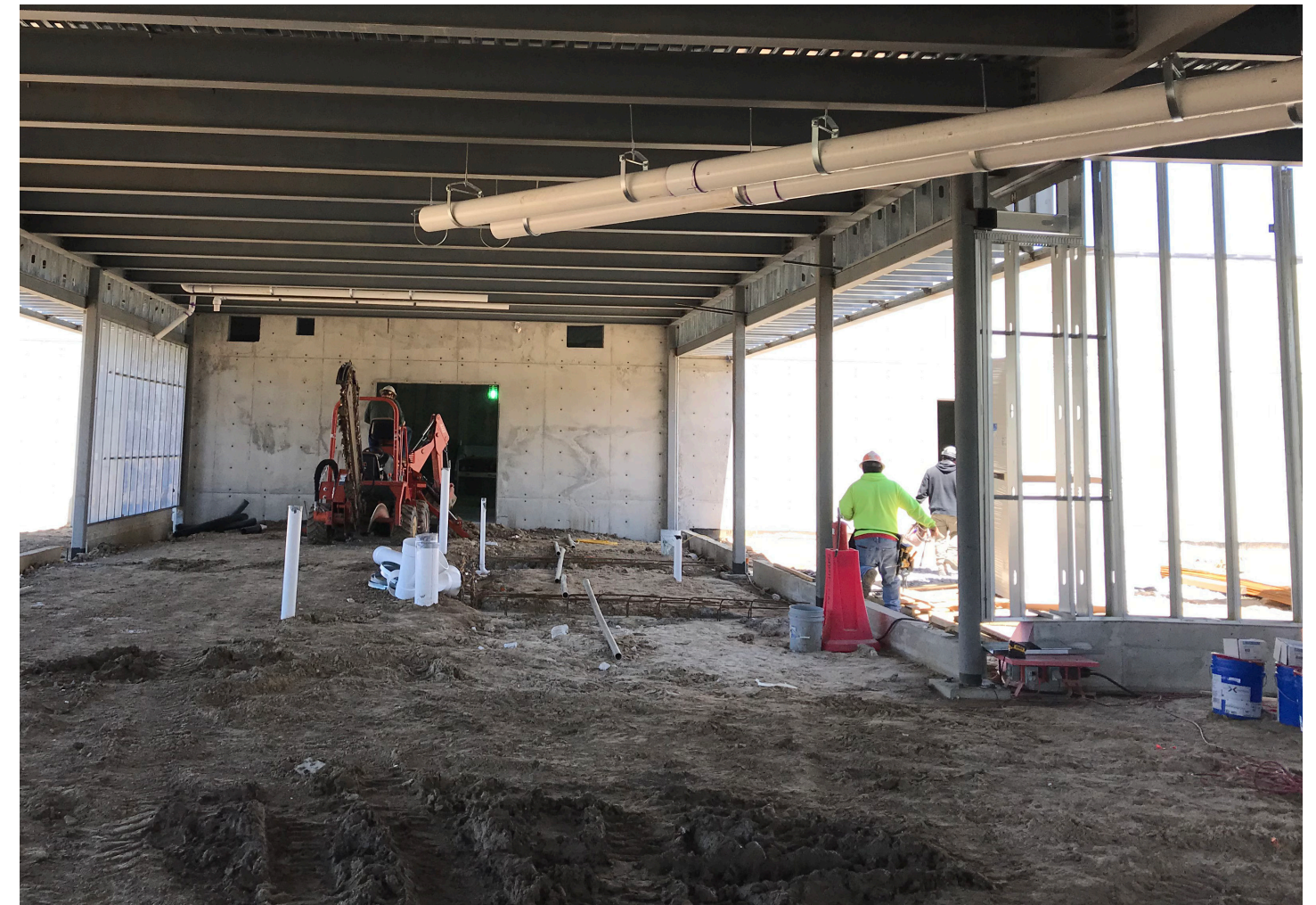
Crete Public Library under construction.