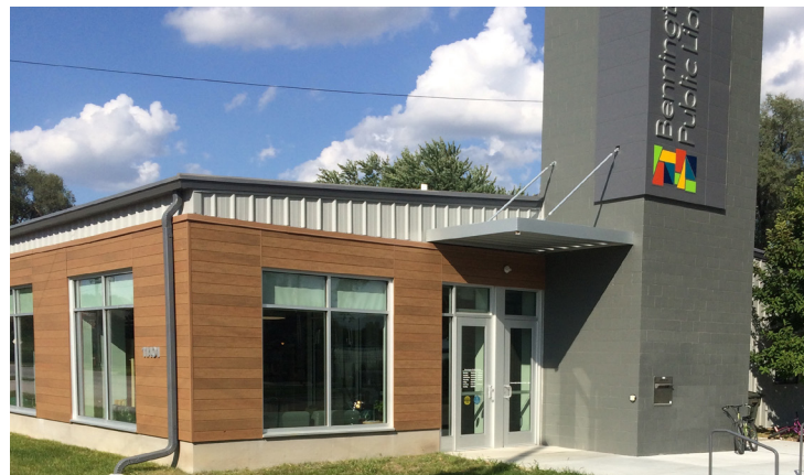
Bennington Public Library opened its doors April 16, 2018.

At DED, we're on a mission to support and empower communities as they work to achieve their development goals. We believe that economic opportunity and quality of life are the key ingredients to creating thriving places. The amenities and qualities that make a community a great place to live are also those that help to attract and retain residents, spur economic growth and enhance local well-being.