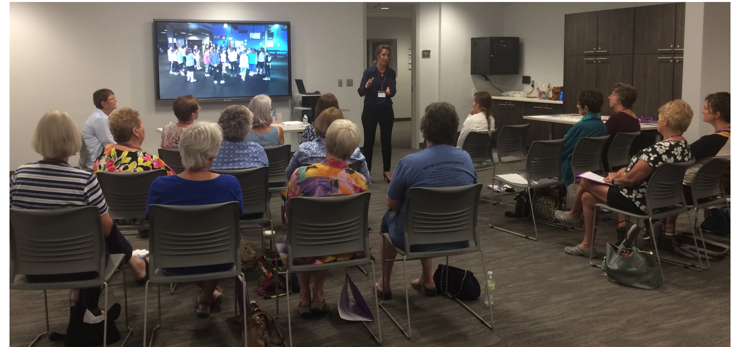
Bennington Public Library.

Several Nebraska cities received funding for capital construction projects designed to grow their communities' learning and recreational opportunities. A total of $4,476,677 for 14 capital construction projects will be utilized for projects related to the construction, renovation and development of civic, cultural and convention centers. For those 14 projects, total local cost-share at the time of application submission reached $18,696,549. The agency awarded projects based on scoring selection criteria listed in Neb. Rev. Statute 13-2707 and detailed in Title 90 Rules and Regulations and Application Guidelines. These awards fully expended the available resources in the fund. One awarded community received less than its requested amount due to limited available funds. Nine