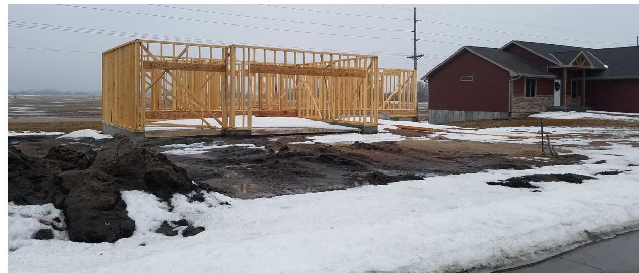
Single-family home for sale in Central City, under construction.