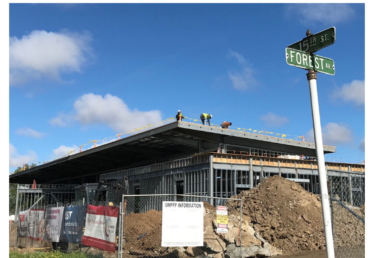
Crete Public Library exterior.

This will enable the growing number of community events to have a functional facility at the focal point of the city. The City provided a match of $272,000 including the Polk County Foundation Band Stand Fund's accumulation of $32,822 from 101 donors in 17 states. The budget for the project is $544,000.