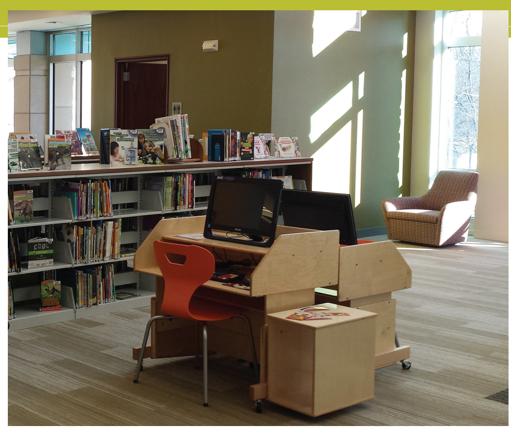
Ashland Community Resource Center

and Regulations and Application Guidelines. These awards left $35,480 remaining in the fund. Below is summary information provided in each application: